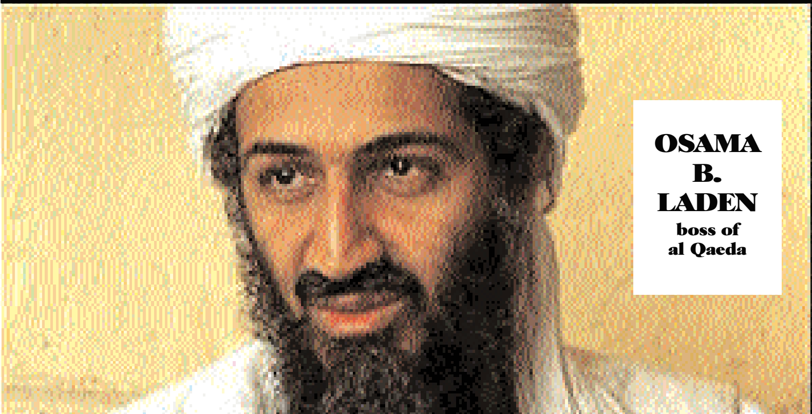
OSAMA B. LADEN boss of al Qaeda

Charged with the world's worst terrorist massacre, 11 September 2001, New York, USA.